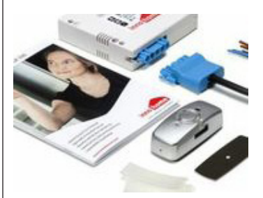
Stove Guard SGK500 Kit

It has many practical applications to prevent unattended cooking fires; from supporting older people in their own home